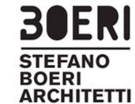
Stefano Boeri Architetti, Italy