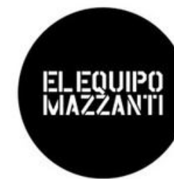
El Equipo Mazzanti, Colombia