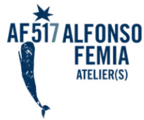
Atelier Alfonso Femia, Italy