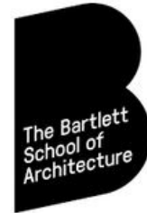
The Bartlett School of Architecture