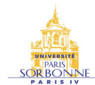
Sorbonne University, France